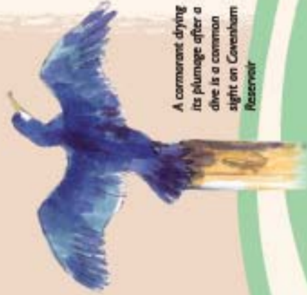
A cormorant drying its plumage after a dive is a common sight on Covenham Reservoir

Experience the beauty of big skies, grace of the sail and tranquillity of the water. Enjoy unspoilt Lincolnshire rural villages with their red brick farm houses and quiet lanes. Fill your lungs with fresh air and reap the benefits of this nostalgic walk in the countryside.