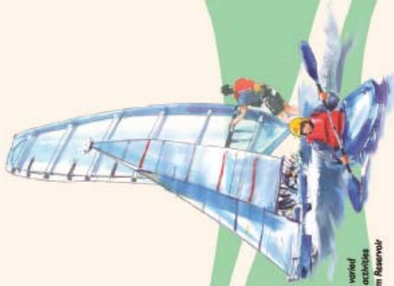
Some of the varied water sport activities on Covenham Reservoir