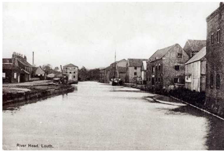
River Head, Louth.